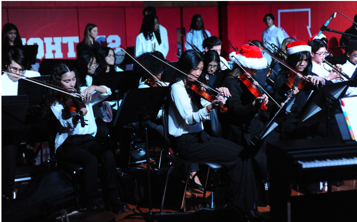
THE ENTIRE CONCERT BAND PERFORMS "SLEIGH RIDE" AS THE FINAL PIECE OF THE CHRISTMAS CONCERT