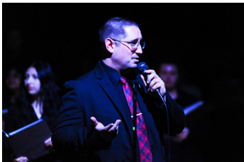
CULLINAN EXPLAINS HOW THE CONCERT CHOIR SONGS ARE CHOSEN.