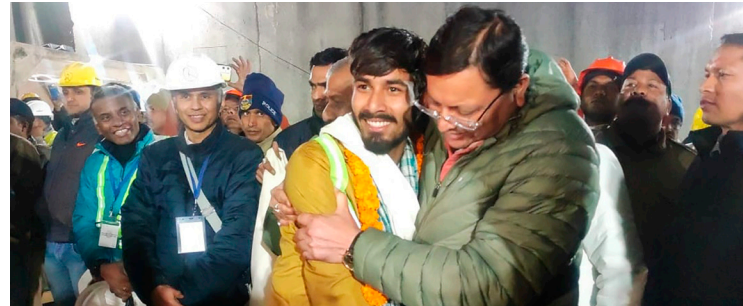
CHIEF MINISTER (RIGHT) GREETING A RESCUED WORKER (LEFT) AS OTHERS CELEBRATE AROUND THEM.

The 41 rescued workers will each be given checks of 100,000 rupees ($1,200) and paid time off for up to a month to spend at home with their families.