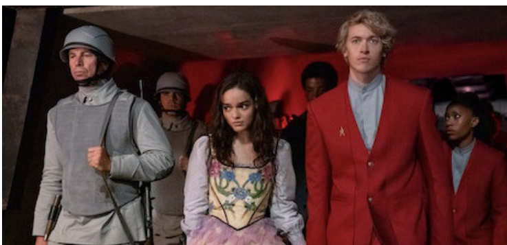
LUCY GRAY BAIRD ENTERS THE CAPITOL FOR THE FIRST TIME ACCOMPANIED BY A YOUNG CORIOLANUS SNOW.