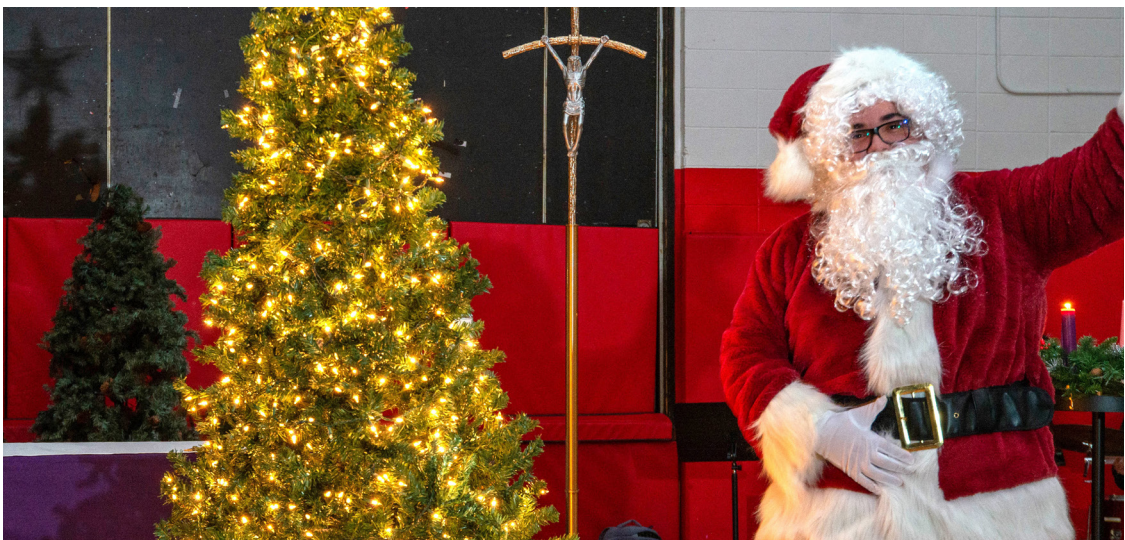
SANTA CLAUS SHOWS UP TO LIGHT THE SCHOOL'S TREE AT THE END OF THE AQUINAS STAR MASS.