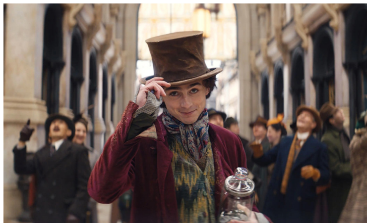
A YOUNG WILLY WONKA TIPS HIS HAT WITH A MISCHIEVOUS GRIN AS THE CROWD BEHIND HIM LOOKS UP IN WONDER AT SOME OF HIS UNIQUE CREATIONS.

Chalamet’s take on the chocolatier was quite positive and quirky, but it lacks the mystery and cruelty of Gene Wilder’s Willy Wonka. The shift makes Wonka more relatable but distances him from the spikiness of Dahl’s writing. Nonetheless, the movie was gold as it warms the hearts of children and adults alike.