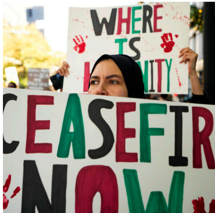
PROTESTERS ACT IN SUPPORT OF A CEASE-FIRE AGAINST THE PALESTINAINS IN GAZA

the occurrence of the cease-fire and the release of numerous hostages invoke a feeling of hope for all those affected by the war.