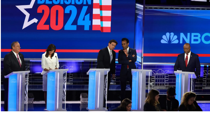
REPUBLICAN PRESIDENTIAL CANDIDATES AT THE PRIMARY DEBATE INTERACT DURING A COMMERCIAL BREAK.

No matter the result of the upcoming presidential election, the thrill of watching each step rivals the greatest sporting competitions. The importance of pertaining politics as a point of unity instead of division is more important than ever during election season, no matter the type of election.