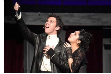
SWEENEY RELISHES REVENGE AS LOVETT FAWNS OVER HIM.