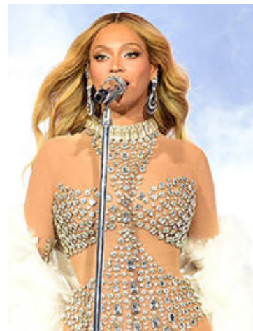
BEYONCE PERFORMS IN A GLITTERY BODY SUITE DURING ONE OF THE PROMINENT SCENES OF HER BEHIND THE SCENES DOCUMENTARY.

So regardless of any obstacles trying to stop her, Beyonce only shows that she still knows what she's doing, and fans have only loved her even more for that.