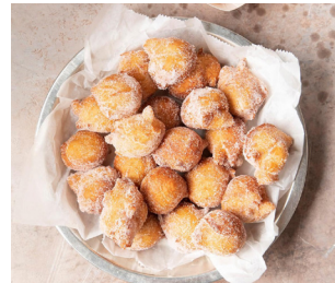
FILHOS FINISHED PRODUCT.