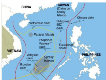
SEVERAL COUNTRIES HAVE CLAIMS OVER THE AREA.

In summary, the South China Sea dispute is a complex and multifaceted geopolitical issue involving historical claims, national pride, strategic interests, and the contest for natural resources. The ongoing tensions highlight the challenges of international diplomacy and the risks of military confrontation in a globally significant maritime region.